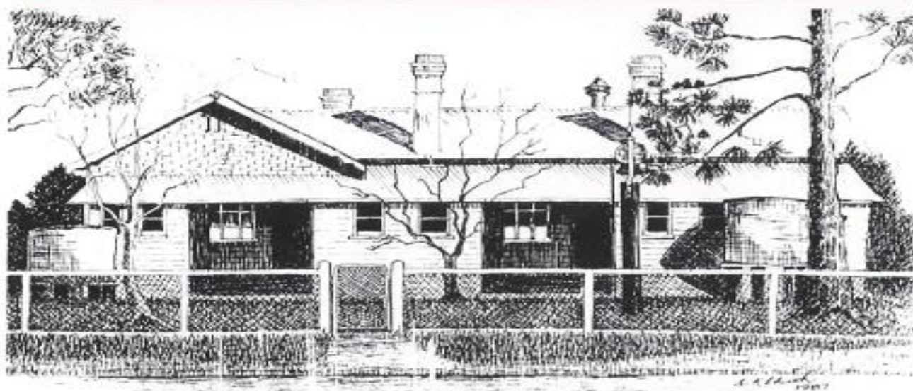
THIRLMERE PUBLIC SCHOOL 1983